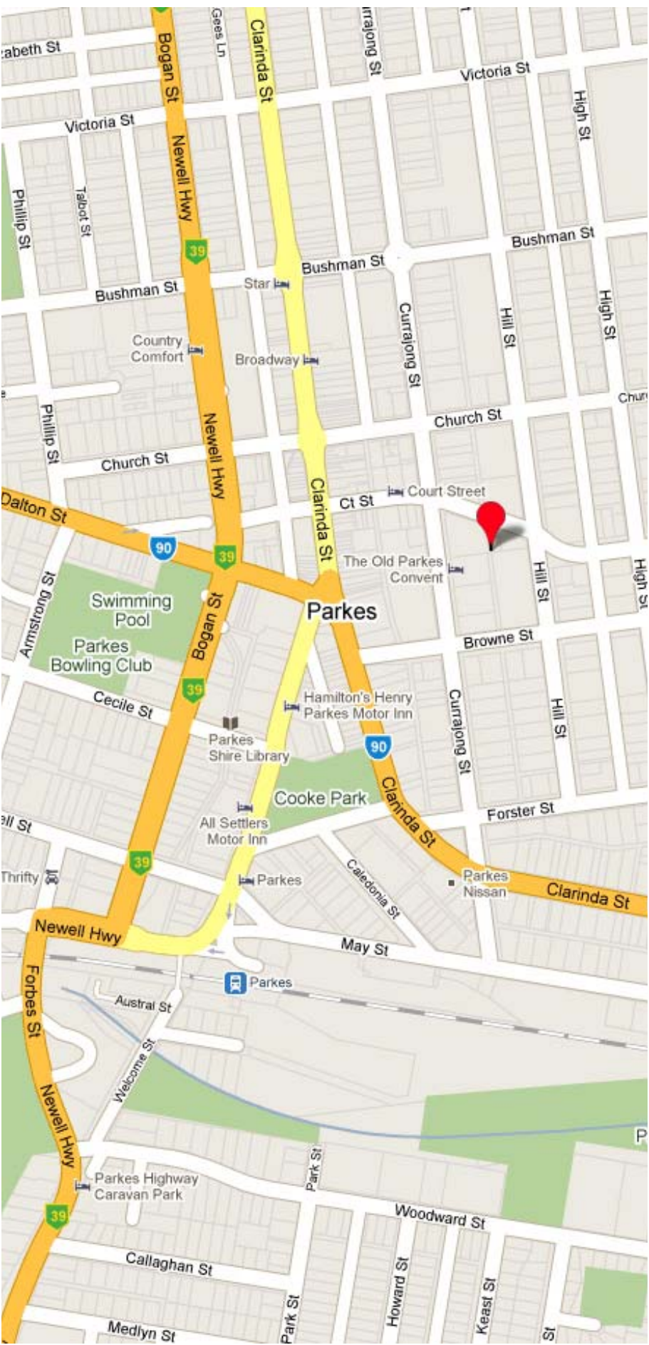
Locality Plan NTS